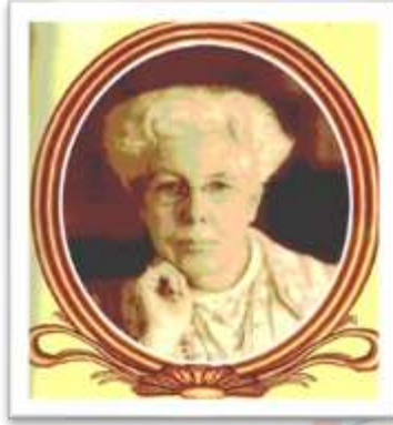
Dr. Annie Besant