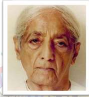
Sri Jiddu Krishnamurti