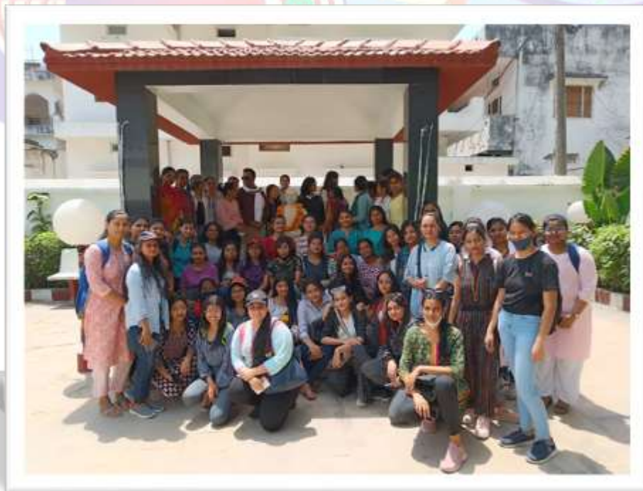
Visit to Munshi Premchand Birthplace Lamahi, Varanasi