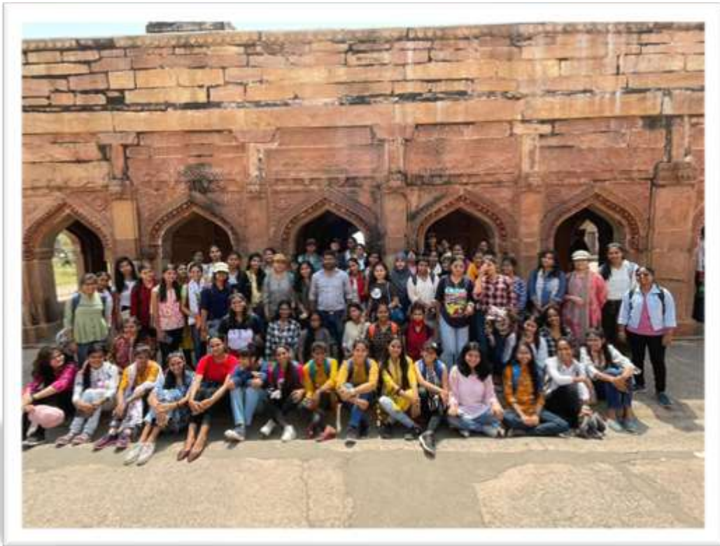
Sonawa Mandap, Chunar Fort, Mirzapur