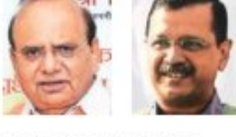
L-G Saxena, CM Kejriwal

THE WAR of words between the Delhi government and Lieutenant Governor VK Saxena over poor conditions in unauthorised colonies and slums continued the second day in a row, after the latter posted photos of his visit to Qalandar Colony in Shahdara, asking the CM to take action. On Tuesday, when the L-G visited Sangam Vihar, posting photos from his visit and accusing the AAP government of not improving the living conditions in these areas despite being in power for nine years, Kejriwal had said that Saxena was playing the role of the opposition despite holding a constitutional position. Kejriwal also directed the Chief Secretary to take action in the matter immediately and sought a daily report. On Wednesday, after his Shahdara visit, Saxena tagged Kejriwal in a post on X (formerly Twitter), and said it was his constitutional responsibility to highlight the issues of the people before the Chief Minister. "From the first day of taking charge till today, I walked more than 1,600 kms in different areas of Delhi in 650 days and... always kept you informed about the problems... Local people said that 35-40 thousand people live a pitiable life in about