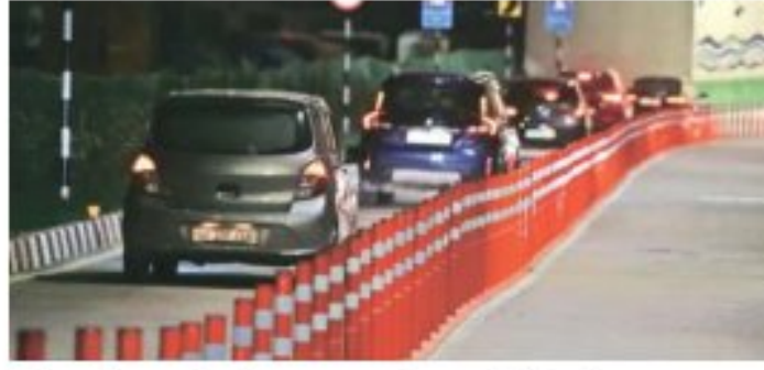
The underpass has been opened on a trial basis.

AFTER a delay of more than a year, the Delhi PWD on Tuesday partially opened one section of the Bhairon Marg underpass for traffic, on a trial basis. Only one lane of the underpass is complete and commuters coming from ITO and Sarai Kale Khan have to enter and exit from the same lane. "The underpass was bifurcated into two - one for traffic coming from ITO towards Bhairon Marg and the other from Bhairon Marg to Sarai Kale Khan.